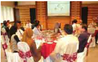
8 January & 1 April 2008 MNRB Group Media Luncheon

In conjunction with the "Hari Raya Aidilfitri" celebrations, MNRB Group invited more than 1,500 guests including numerous business partners. The guests were treated to a variety of delicious food and entertained with a 'Ghazal' performance through out the event.