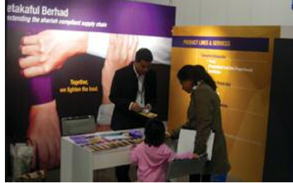
13 – 15 January 2008 Malaysia Services Exhibition 2008

MNRB Group had organised two media luncheons with the senior editors of the printed and electronic media. It was indeed an excellent avenue for the MNRB Group Senior Management personnel to interact with the media.