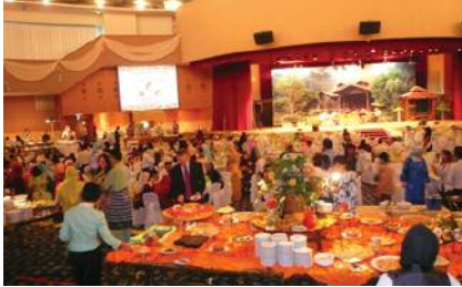
29 October 2007 MNRB Group Hari Raya Open House

In conjunction with the "Hari Raya Aidilfitri" celebrations, MNRB Group invited more than 1,500 guests including numerous business partners. The guests were treated to a variety of delicious food and entertained with a 'Ghazal' performance through out the event.