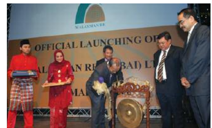
18 March 2008 The Official Launching of Malaysian Re Dubai

MNRB Retakaful was invited by Malaysian Takaful Association (MTA) to participate in its "Kempen Kesedaran Kewangan Islam (KEKWI)" which was jointly organised by Jabatan Kemajuan Islam Malaysia (JAKIM), Persatuan Institusi Perbankan Islam Malaysia (AIBIM), MTA and Bank Negara Malaysia. The aim of the event was to promote Islamic financial products; and create awareness to the public at large, as well as to encourage Islamic financial professionalism in Malaysia.