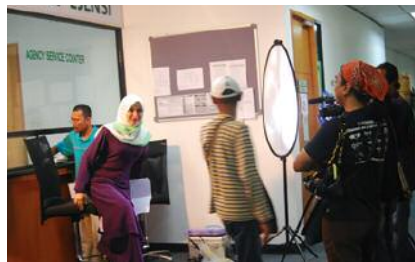
15 January 2008 Takaful IKHLAS in WADI (Wang Anda Dan Islam), Astro

MNRB Retakaful participated in the first-ever Malaysia Services Exhibition 2008 (MSE 2008) organised by the Malaysia External Trade Development Corporation (MATRADE) in Sharjah, United Arab Emirates. The exhibition was officiated by Sheikh Sultan Mohamed Sultan Al Qasimi, the Crown Prince of Sharjah. The Minister of International Trade & Industry, YB Datuk Seri Rafidah Aziz was also present at the official opening. The essence of MNRB Retakaful's participation was to create awareness on the existence of the Company and also to promote Malaysia as the international centre for Islamic finance.