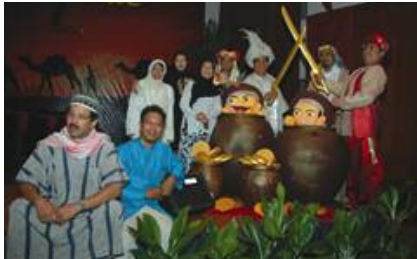
15 – 17 February 2008 Takaful IKHLAS Family Day 2007