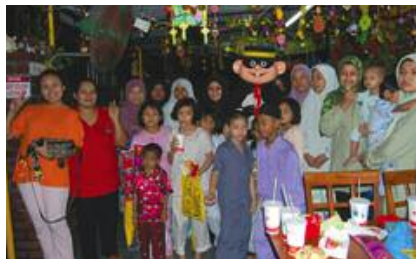
9 October 2007 Takaful IKHLAS visit to Pusat Perlindungan PERNIM

In continuing the tradition of organising charitable activities, MNRB with Malaysian Re, MNRB Retakaful and Malaysian Re Dubai, start off the festive seasons with a good cause by sharing the spirit of the holy month of "Ramadhan Al-Mubarak" with 50 orphanages from Rumah Amal Limpahan Kasih, Puchong, Selangor Darul Ehsan. Employees of MNRB and Malaysian Re used the opportunity to do their bit by giving cash donations and clothes to the children.