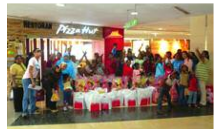
4 November 2007 Festive Cheers For The Underprivileged With The Employees Of MNRB Group