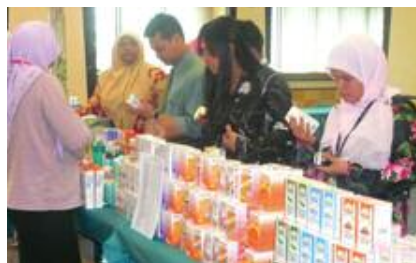
26 – 27 February 2008 All About Supplements

MNRB is very concerned on the health and wellbeing of its staff regardless male or female. MNRB Group recently organised a “Well Women Campaign” as part of the activities of their Corporate Social Responsibility program. The program offered a complimentary health check-up to detect any signs of major female illnesses. The free check-up was conducted at the Premier Screening and Wellness Centre, Ampang Puteri Specialist Hospital in Ampang. Staff were encouraged to participate in this health check-up in view that these complimentary health check-up was a rare opportunity. In conjunction with the campaign, a wellness doctor was invited to deliver a talk entitled, “Well Women Health” and was held at both Bangunan Malaysian Re and Bangunan Takaful IKHLAS.