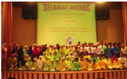
4 October 2007 MNRB Shares The Spirit Of Ramadhan With The Underprivileged