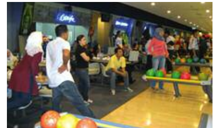
21 April 2007 Takaful IKHLAS Friendly Bowling Game

In addition, MNRB also provides sponsorship to selected associations, which provide training to the industry.