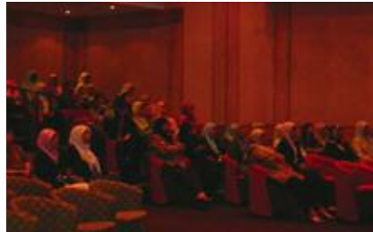
18 February – 30 March 2008 Well Women Campaign

The Staff Breakaway program was designed to explore further the concept of team building and team synergy for organisation to get maximum results from everybody. It also creates the true meaning of working together as a team while maintaining interdependency among the individuals. It is also hoped that upon completion of the Staff Breakaway, employees will be able to provide quality service as a team, appreciate diversity and working in teams on top of enhancing the relationship among the team members.